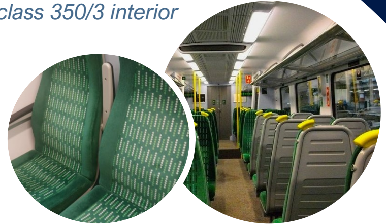
Pre-refurbishment class 350/3 interior

Primarily this was to provide a vastly improved customer experience for passengers. The enhancements have also aligned maintenance for Siemens at Kings Heath maintenance depot in Northampton.